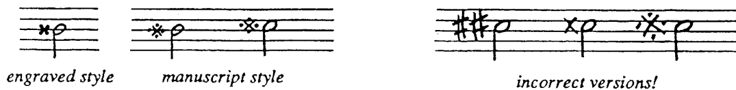
EXAMPLE 3 - 7

A double sharp indicates that the note it precedes is to be raised by two half steps from its unaltered state. The manuscript version (i.e. hand written version) of the double sharp differs slightly from the engraved version (see Example 3-7). Draw the double sharp as an "X" the size of one full space, with four small dots placed, one each, inside the spaces created by the crossed lines.