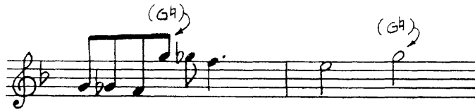
EXAMPLE 3 - 12

When an accidental not included in the key signature precedes a note, it affects only that pitch in that octave, for the duration of the entire measure or until it is "canceled" by another accidental.