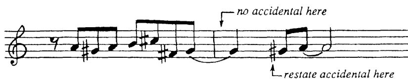
EXAMPLE 3 - 14

An accidental applies to the full duration of the note it attends. Therefore, an accidental should not precede a note that has been tied over from the measure before, though it must be restated at the first recurrence of that pitch in the new measure.