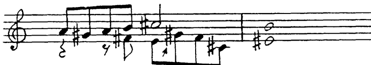
EXAMPLE 3 - 16

This is particularly mandatory if two or more individual players are to read from the same staff.