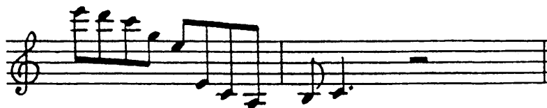
EXAMPLE 1 - 2

The five line, four space staff provides for the location of pitches occurring only within the range of an eleventh, that is, only from the space directly beneath the first line up through the space just above the fifth line. When a notated pitch outside this range is desired, an extension of the staff must be provided. Such extensions are referred to as leger lines .