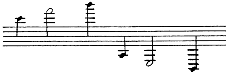
EXAMPLE 2 - 9

Stems attached to notes located on the second leger line above the staff or higher must be drawn so that they extend down to, and contact, the middle line of the staff; likewise, stems attached to notes located on the second leger line below the staff or lower must also extend up to, and contact, the middle line.