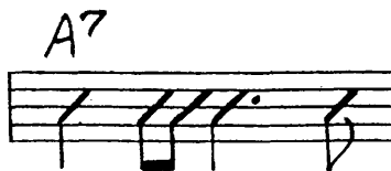
EXAMPLE 2 - 15 b.

The open note-head version of the slash is an oblique parallelogram and is used when notating half note and whole note durations.