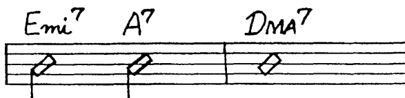
EXAMPLE 2 - 16

The open note-head version of the slash is an oblique parallelogram and is used when notating half note and whole note durations.